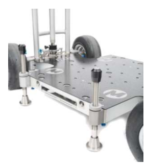
Atatchment for levelling legs: The base platform is built with four tolless mount positions for levelling legs, secured by quick pins so it can be used for cranes.