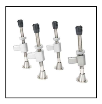
Item No. 7531-0set

Levelling legs set (4 pcs) incl. hand crank