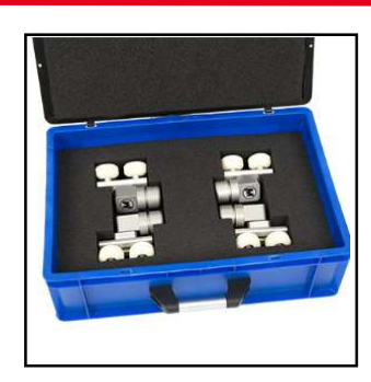
Item No. 2950-500

Track wheels "Skate wheels" incl. transport case (4pcs)