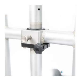
Steering rod with brake function: The angle can be fixed for repetitive rotational movements.