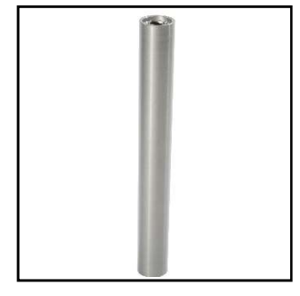
Item No. 2087-3