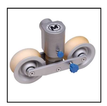
Item No. 2961-01 SET