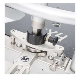
Steering system: The steering system of the 4×4 Dolly is made of special, very hard steel. It ensures the durability of the switchgear unit.