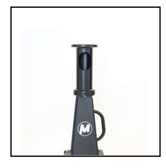
Item No. N800-2 Adapter for Jimmy-Jib