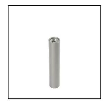
Item No. 2087-2