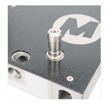
Mount position for seat arm: 9 mounting positions for seatarms on platform