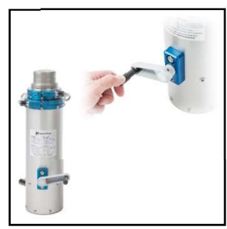
Item No. 2140-0

MT Cranked Riser Version "M" Adjustable length: 47,5 - 87 cm