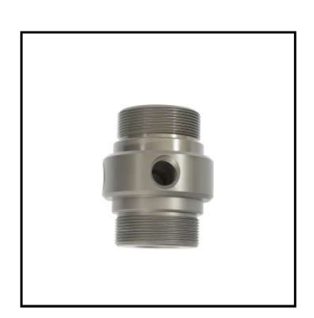
Item No. 2087-5