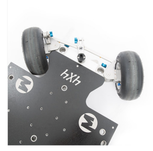
Extreme steering angle: The steering geometry has been enhanced to allow a very large lock angle. Thereby the 4×4 Dolly can be driven with very small radii.