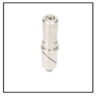
Item No. N200-1000

Adapter for steering rod with 1/4" and 1/8" threads to mount accessories (Magic arm)