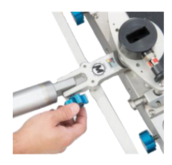
Alternative steering mode: The steering rod can also be used as drawbar, e.g. to better handle a crane mounted on the dolly. 3