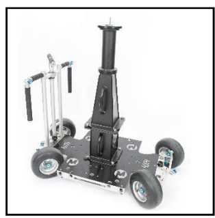
Item No. 8410-0: Crane column (3 piece) (e.g. for MovieJib, ABC Crane 100/120, Jib 100 etc)