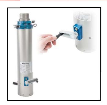
Item No. 2141-0

MT Cranked Riser Version "M" Adjustable length: 47,5 - 87 cm