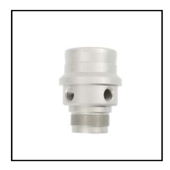
Item No. 2087-7

System low rig adapter "big" (for system low rig tube 80mm)