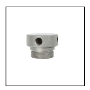
Item No. 2087-4