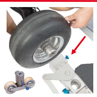
Quick wheel switch: Quick toolless switch from pneumatic to track wheels