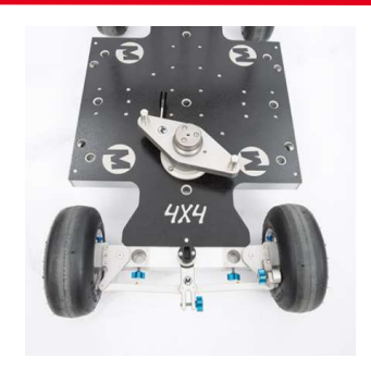
4x4 Dolly Basis with several mounting positions for the turnstile: 7 mounting positions for the turnstile on the platform