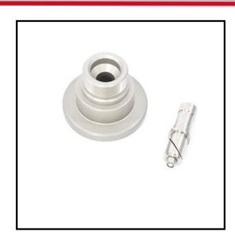
Item No. N800-2