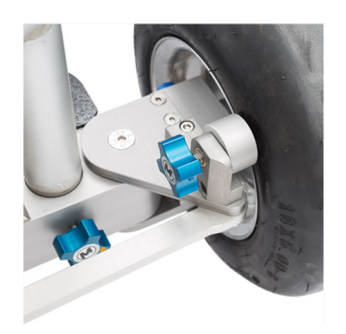
Wheel brake: Wheel brakes can be found on the rubber wheels. Thereby it is possible to brake directly on the large wheels.