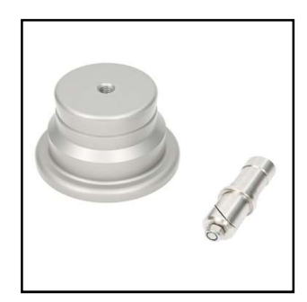
Item No. N100-6

Track wheels "Skate wheels" incl. transport case (4pcs)